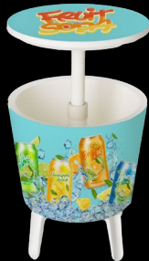
45L Cool Bar