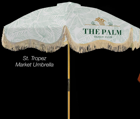
St. Tropez Market Umbrella