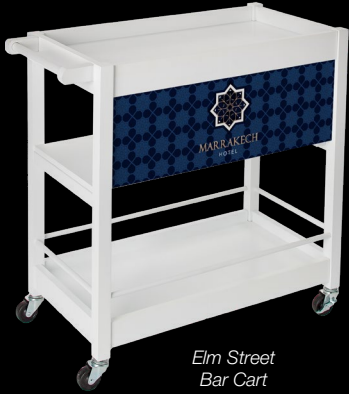
Elm Street Bar Cart