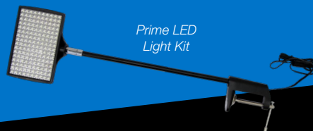
Prime LED Light Kit