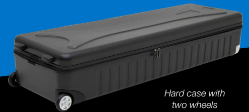
Hard case with two wheels