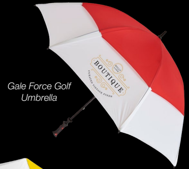
Gale Force Golf Umbrella