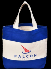
Striped Canvas Tote