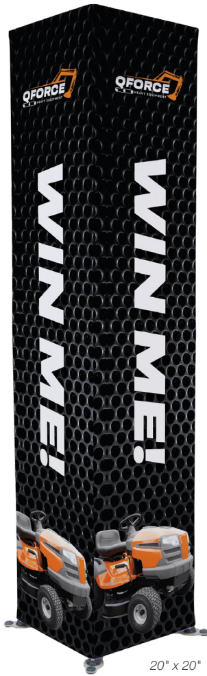
20" x 20"