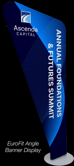
EuroFit Angle Banner Display