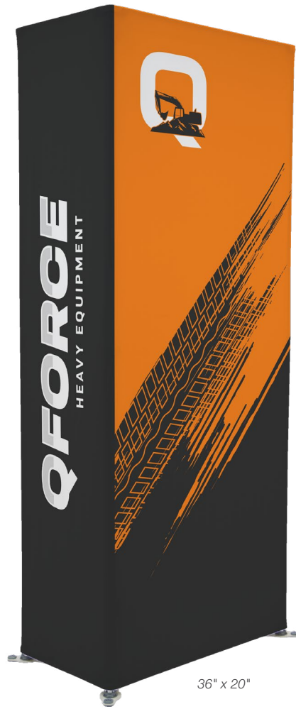
36" x 20"