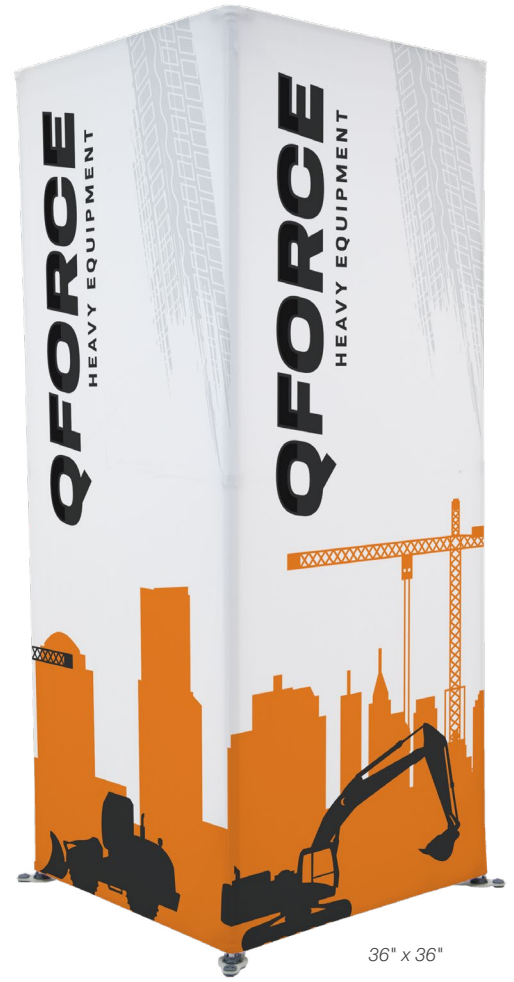
36" x 36"