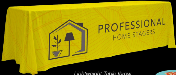
Lightweight Table throw