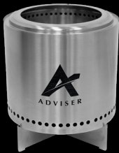
Stainless Steel Fire Pit